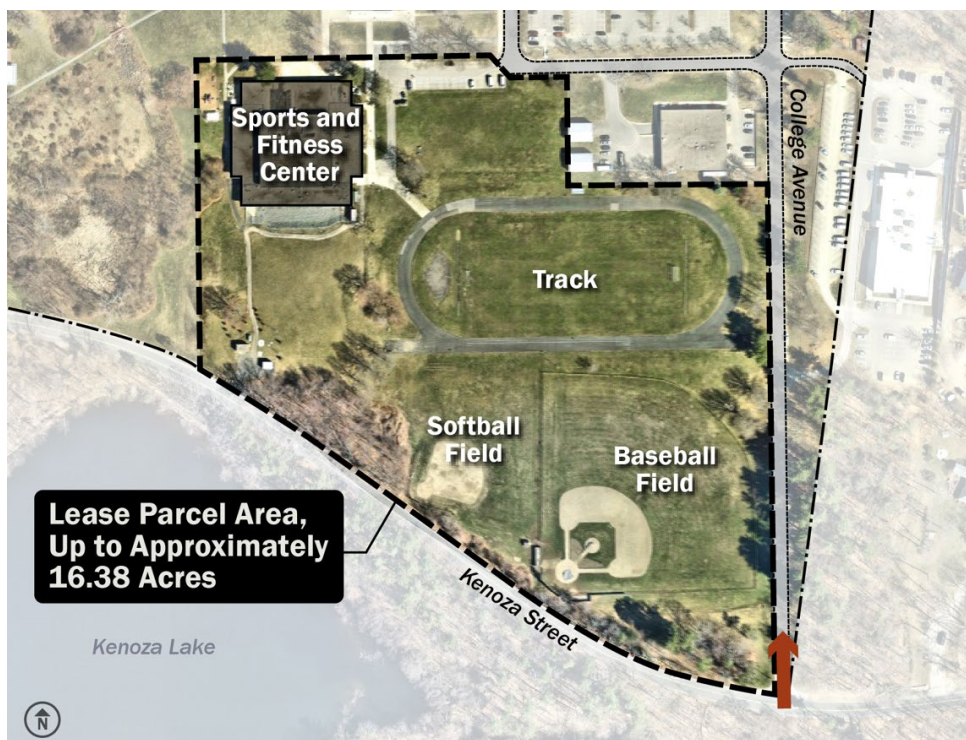
Figure 2. Aerial view of existing conditions of the site

This approach, which involves shared use of buildings and fields by NECC and a partner, will tap the potential of a partner to bring capital resources to improve existing facilities, and its ability to generate and capture new private revenue streams on site. Through this partnership, NECC will be able to benefit from improved facilities while offsetting both its capital costs and long-term operational burden. Third-party monetization of the improvements may include advertising and/or naming rights compatible with the primary athletic, health and wellness uses as further described in Section VI. This will help ensure that operations and capital reserves are adequately funded, provide greatly improved health and wellness amenities for the students, and enliven the site through community programming consistent with NECC's mission.