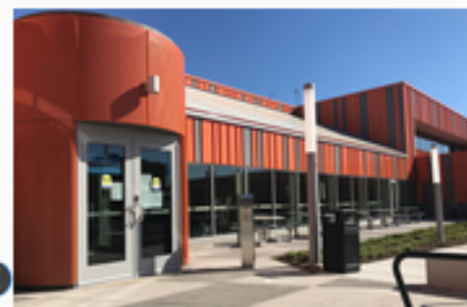
Northern Essex Community College Lawrence

Founded in 2017, HELM (Higher Education Libraries of Massachusetts) is an association of Massachusetts college libraries in public higher education. HELM libraries are also members of the Fenway Library Organization (FLO) , a consortium of academic and special libraries in Massachusetts. FLO provides library support and hosts the HELM catalog .